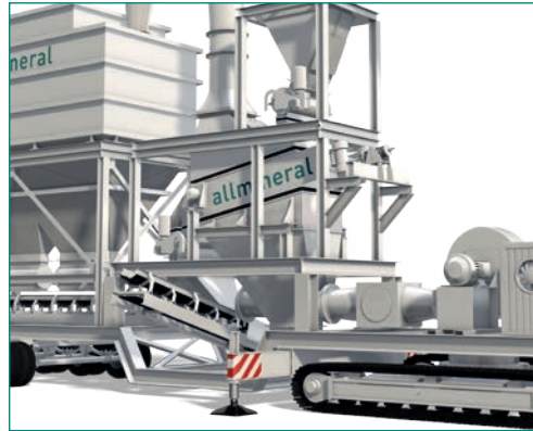
allair® | mobile-version

The allair® -jig was invented for dry upgrading of coal. The advantages of jigging processes are combined with the advantages of dry beneficiation processes; e.g., no need for process water, clarified water or water purification, no fines dewatering, no slurry impoundment.